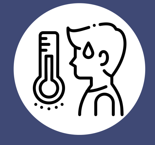
A temperature of 100° F or higher

1. Is your student experiencing any of the following new or worsening symptoms?