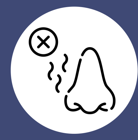
Loss of taste or smell