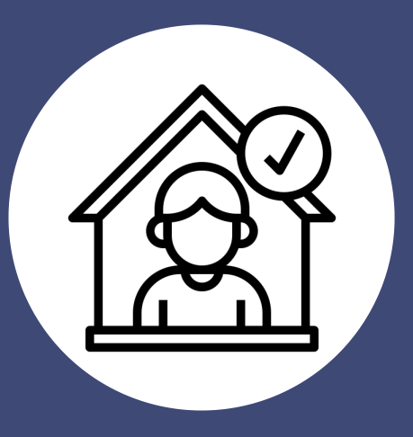
Stay home and self-isolate